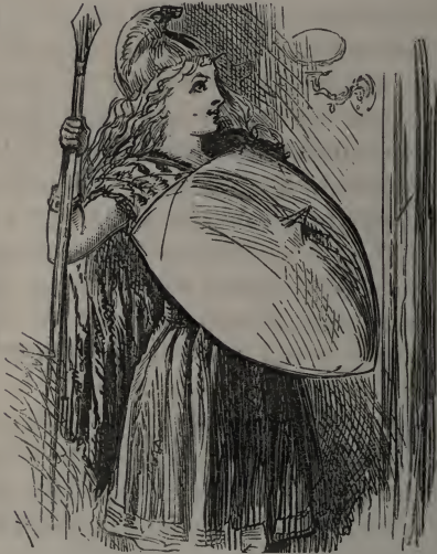
CHRISTIE AS QUEEN OF THE AMAZONS.

your neck, or pick your way like a cat in wet weather, but come with effect , for I want that scene to make a hit."